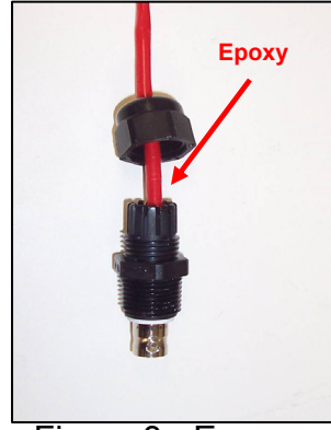
Figure 3 - Epoxy