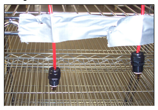
Figure 4 – Epoxy Hardening